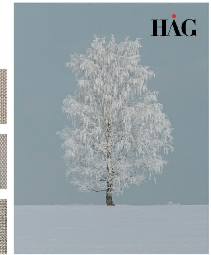
Gabriel, Cura, 60112